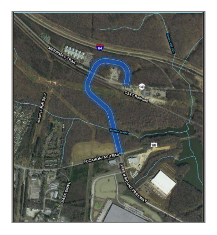
New I64 Connector

This information was obtained from sources deemed to be reliable, but is not warranted. This offer subject to errors and omissions, or withdrawal, without notice.