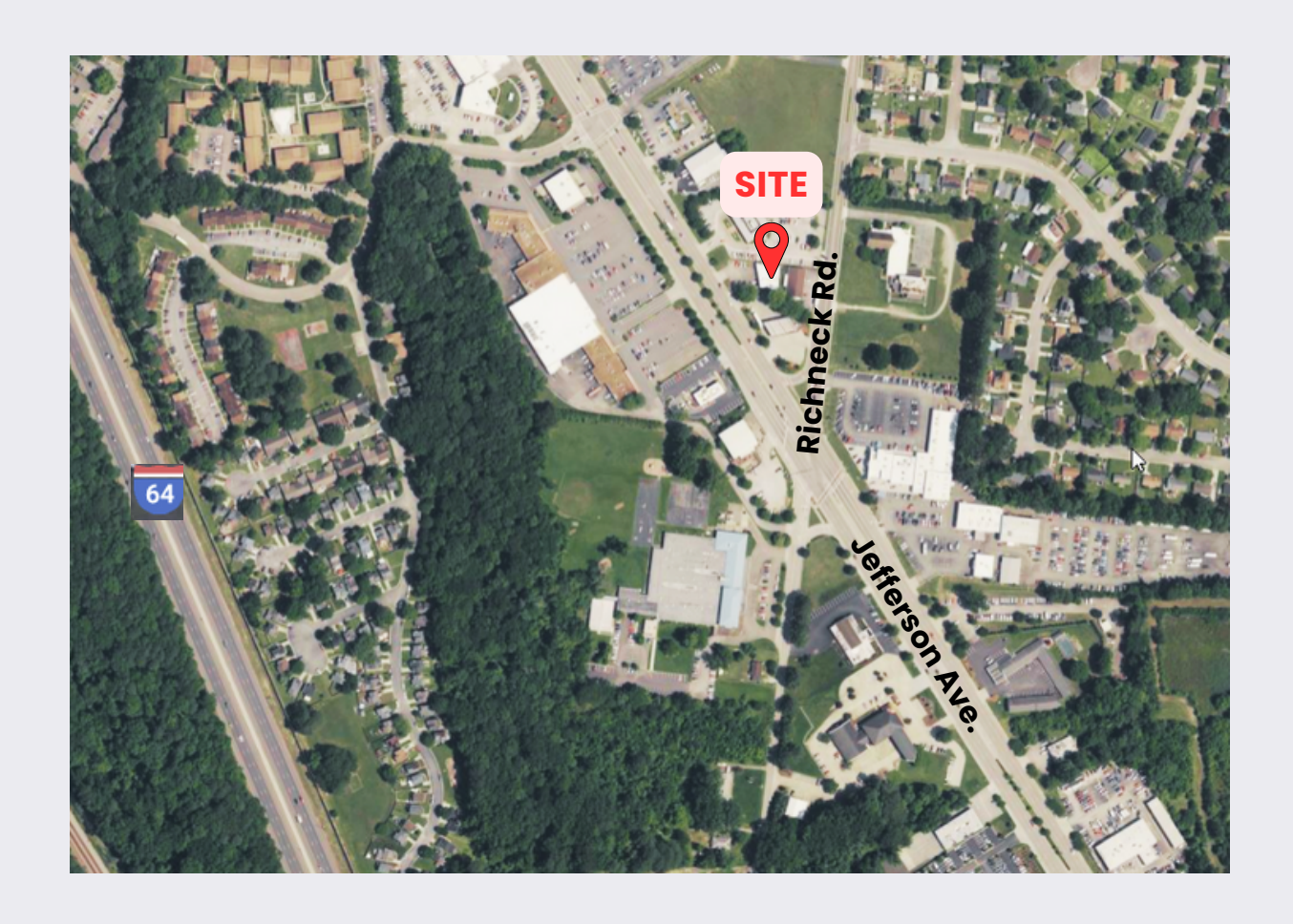
The information contained herein has been obtained from sources deemed to be reliable but is not warranted. This offer subject to errors and omissions, or withdrawal, without notice