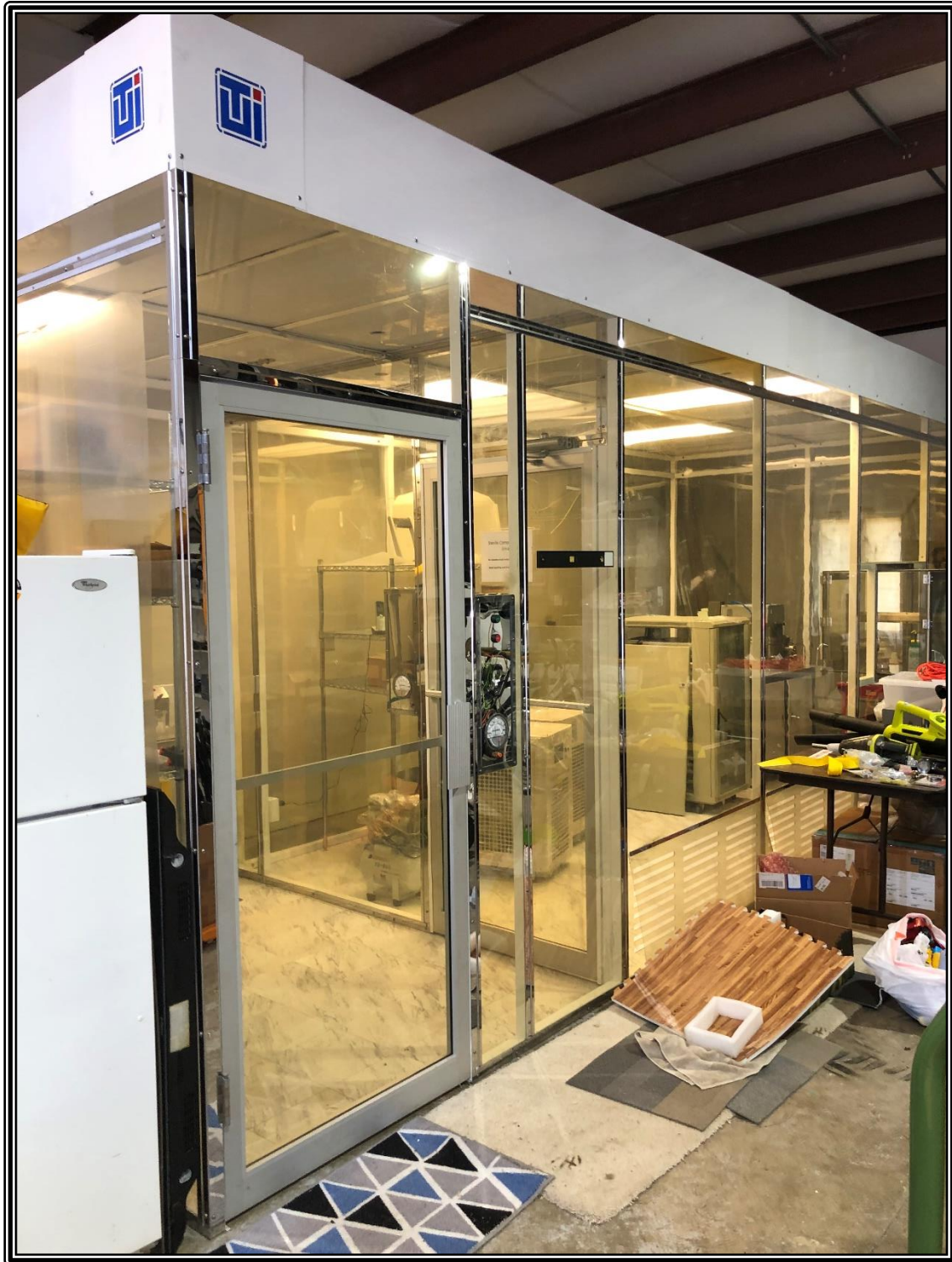
Portable clean room

This information was obtained from sources deemed to be reliable but is not warranted. This offer subject to errors and omissions, or withdrawal, without notice.